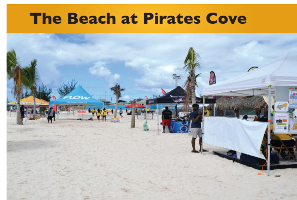
The Beach at Pirates Cove